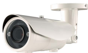
Detect Flame & Smoke Onvif Bullet Camera