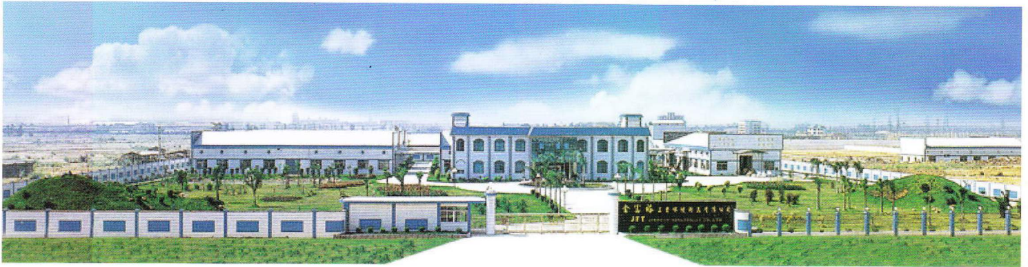
Si Hui Factory is located in Guang Dong, China with areas of 33,330 square meters

JINFUYU INDUSTRIAL CO., LTD's four promises of Quality insistence , Customers Satisfaction , New Technical Development and Quick Response are our key attitudes that bring to all our clients. We will continue to focus on this and try our best to satisfy each client's demand through our dynamic customers support team.