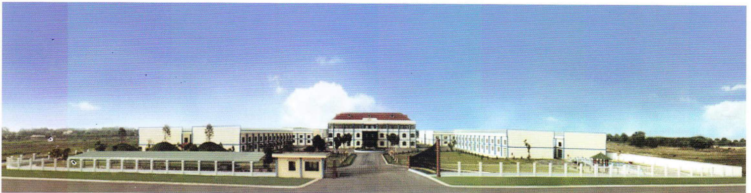
Jiang Xi Factory is located in Jiang Xi, China with areas of 46,660 square meters